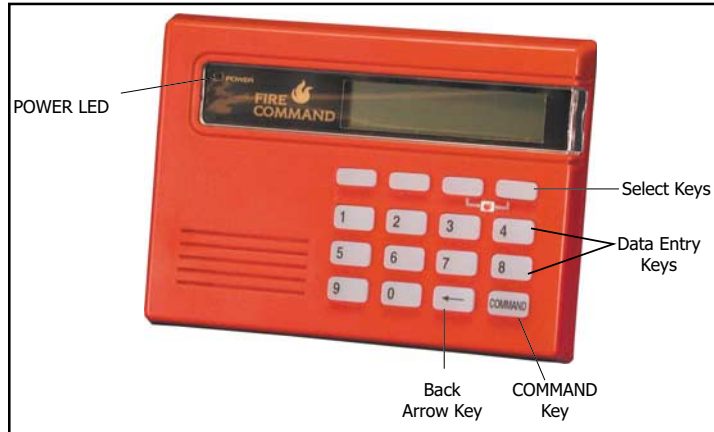
690F Fire Command Keypad

This device has been placed on the premises to allow you to properly operate the system and review previous event history. The keypad provides a passcode protected User Menu where you can access the functions needed to operate the system. See Keypad User Menu . In addition to the User Menu, the items below list operational features of your keypad.